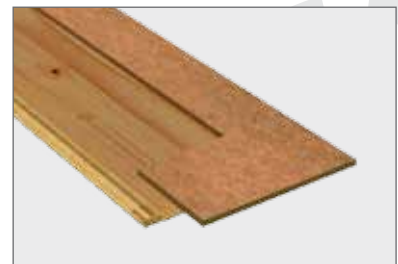
Under-structure with HDF board.

Length: 2200mm Width: 209mm m 2 /board: 0.46m 2 Boards/bundle: 4 m 2 /bundle: 1.84m 2 Bundles/pallet: 40 m 2 /pallet: 73.60m 2 Weight/pallet: 766.80 kg